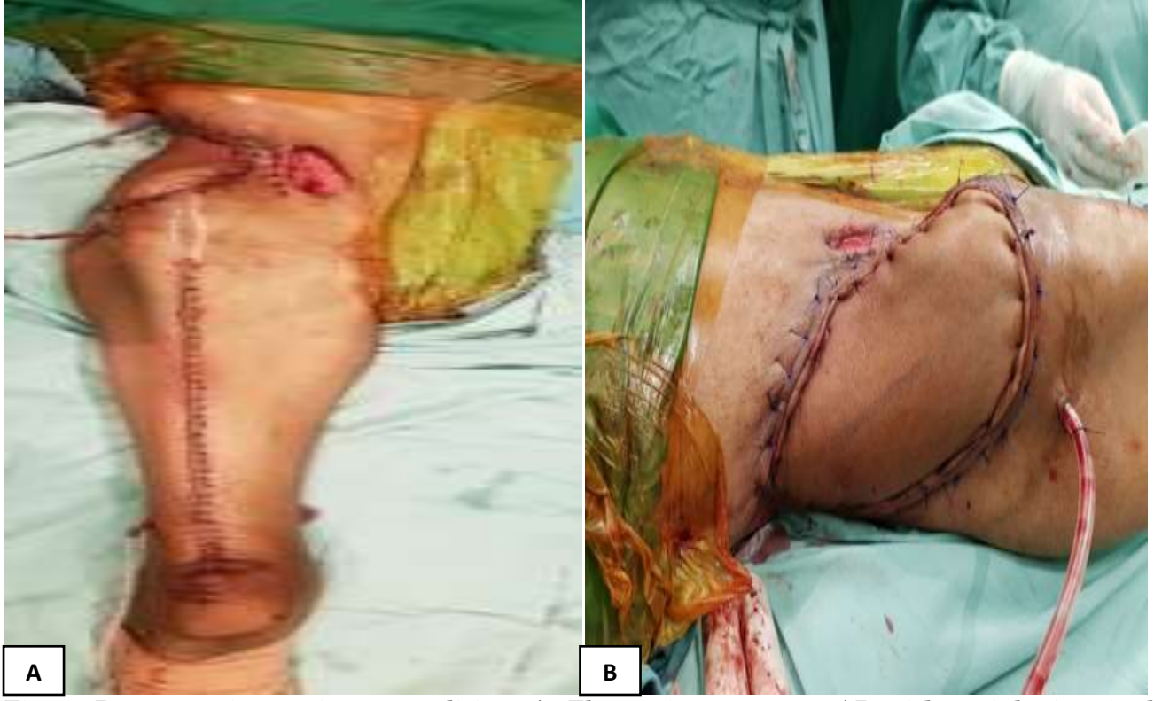
Fig. 4: Postoperative patient's condition. A. The patient appears AP with a right inguinal defect that has been closed using the Rectus Femoris Flap, leaving little injury to the anterior abdominal wall and modern dressing dressing B. The patient's defect appears lateral