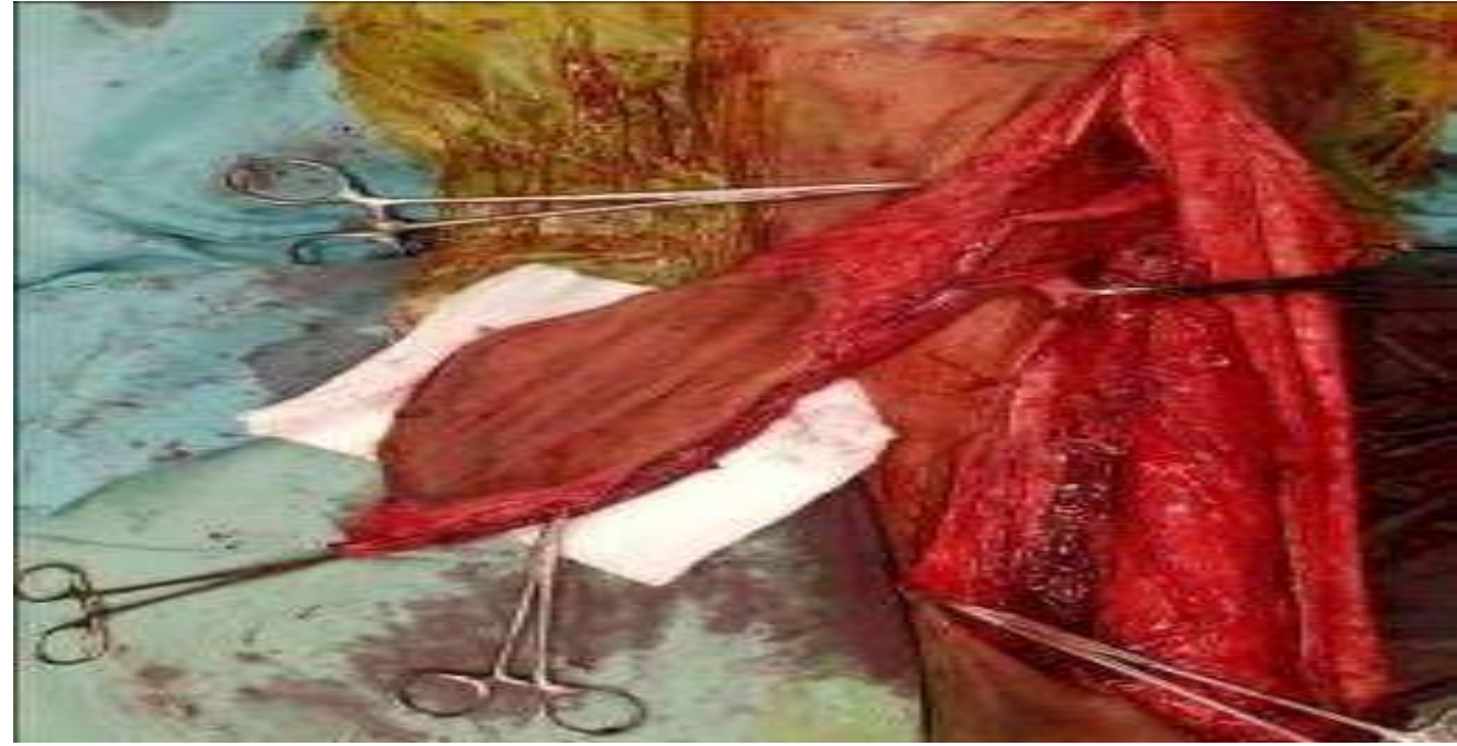
Fig. 2: Harvesting rectus femoris muscle