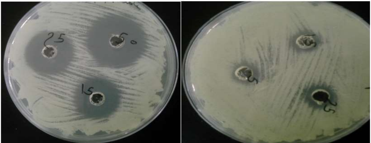
Figure 2: Effect of alcoholic extract of the olive leaf and dental gel in growth Staphylococcus mutans of Nutrient Agar medium at temperature 37 °C for period 48 hrs

Table 3: The susceptibility pattern of dental gel and olive leaf extract on the growth of Staphylococcus mutans .